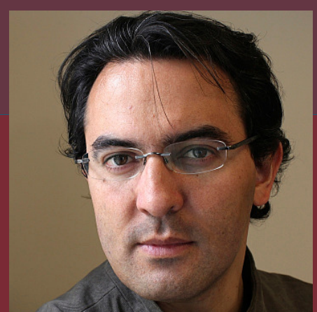
Juan Gabriel Vásquez Novelist

"'One of Us': Conrad, First Author of Modern Globalization"